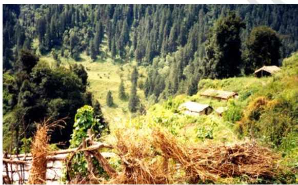
Figure 16.2 A view of a forest life

their teak from a forest farther away. They do not have any stake in ensuring that one particular area should yield an optimal amount of some produce for all generations to come. What do you think will stop the local people in behaving in a similar manner?