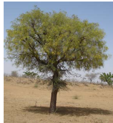
Figure 16.3 Khejri Tree

We need to accept that human intervention has been very much a part of the forest landscape. What has to be managed in the nature and what may be the extent of this intervention? Forest resources ought to be used in a manner that is both environmentally and developmentally sound – in other words, while the environment is preserved, the benefits of the controlled exploitation go to the local people, a process in which decentralised economic growth and ecological conservation go hand in hand. The kind of economic and social development we want will ultimately determine whether the environment will be conserved or further destroyed. The environment must not be regarded as a pristine collection of plants and animals. It is a vast and complex entity that offers a range of natural resources for our use. We need to use these resources with due caution for our economic and social growth, and to meet our material aspirations.